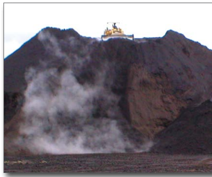
Figure 13. As compost like this is recycled, green house gasses are reduced

When organic materials are composted and then recycled, the composting feedstocks are diverted from already burdened municipal landfills, and landfill-generated methane gas emissions are reduced.