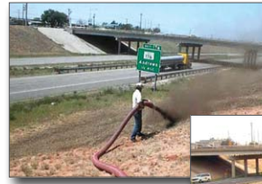
Figure 1. Applying a compost blanket on a bare and eroding slope

Compost blankets can be placed on any soil surface: flat, steep, rocky, or frozen. The blankets are most effective when applied on slopes between 4:1 and 1:1 (horizontal run:vertical rise); such as construction sites, road embankments, and stream