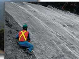
Figure 10. Stapling netting to the slope

Figure 5 is too fine for erosion control. Coarser compost should be avoided on slopes that will be landscaped or seeded, as it will make planting and crop establishment more difficult. But coarse and/or thicker compost is recommended for areas with higher annual precipitation or rainfall intensity, and even coarser compost is recommended for areas subject to wind erosion (Alexander 2003).