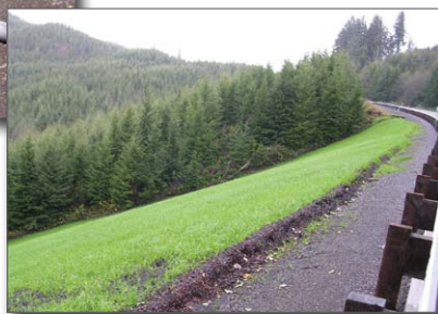
Figure 8. Using a compost berm to divert or defuse highway runoff before it reaches the compost blanket

Fabric netting can also be used to hold the compost blanket on steep slopes (Figure 9). The netting is usually stapled to the slope (Figure 10), and then the compost is blown on the slope and into the netting.