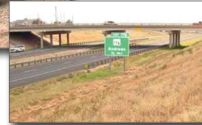
Figure 2. Same slope after revegetation

banks; where stormwater runoff can occur as sheet flow. On the steeper slopes (1:1) the compost blanket should be used in conjunction with netting or other confinement systems to further stabilize the compost and slope, or the compost particle size and depth should be specially designed for this application. Compost blankets should not be placed in locations that receive concentrated or channeled flows either as runoff or a point source discharge. If compost blankets are placed adjacent to highways and receive concentrated runoff from the traffic lanes, they should be protected by compost berms, or a similar BMP that diffuses or diverts the concentrated runoff before it reaches the blanket (Glanville, Richard, and Persyn 2003). Because a compost blanket can be applied to the ground surface without having to be incorporated into the soil, it provides excellent erosion and sediment control on difficult terrain, such as steep or rocky slopes (Figures 3, 4). Projects where the cost of transporting and applying composts is most easily justified are situations that demand both immediate erosion control and growth of vegetative cover, such as projects completed too late in the growing season to establish natural vegetation before winter or areas with poor quality soils that don't readily support vegetative growth (Glanville, Richard, and Persyn 2003).