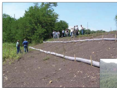
Figure 7. Using compost socks to reduce the runoff velocity

reduce the runoff velocity (Figure 7) or compost berms placed at the top of the slope to divert or diffuse concentrated runoff before it reaches the compost blanket (Figure 8).