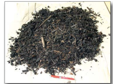
Figure 11. Compost for erosion control on moderate slopes

Figure 5 is too fine for erosion control. Coarser compost should be avoided on slopes that will be landscaped or seeded, as it will make planting and crop establishment more difficult. But coarse and/or thicker compost is recommended for areas with higher annual precipitation or rainfall intensity, and even coarser compost is recommended for areas subject to wind erosion (Alexander 2003).