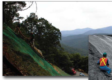
Figure 9. Netting stabilizing a compost blanket

Mature compost for erosion control on moderate slopes is shown in Figure 11, with a red pen for size comparison. The compost in