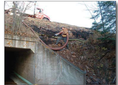
Figure 3. Applying a compost blanket on a steep, rocky slope

banks; where stormwater runoff can occur as sheet flow. On the steeper slopes (1:1) the compost blanket should be used in conjunction with netting or other confinement systems to further stabilize the compost and slope, or the compost particle size and depth should be specially designed for this application. Compost blankets should not be placed in locations that receive concentrated or channeled flows either as runoff or a point source discharge. If compost blankets are placed adjacent to highways and receive concentrated runoff from the traffic lanes, they should be protected by compost berms, or a similar BMP that diffuses or diverts the concentrated runoff before it reaches the blanket (Glanville, Richard, and Persyn 2003). Because a compost blanket can be applied to the ground surface without having to be incorporated into the soil, it provides excellent erosion and sediment control on difficult terrain, such as steep or rocky slopes (Figures 3, 4). Projects where the cost of transporting and applying composts is most easily justified are situations that demand both immediate erosion control and growth of vegetative cover, such as projects completed too late in the growing season to establish natural vegetation before winter or areas with poor quality soils that don't readily support vegetative growth (Glanville, Richard, and Persyn 2003).