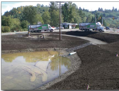
Figure 14. Compost blankets will nurture revegetation, which sequesters carbon and prevents erosion

We no longer have the vast expanses of prairies and eastern forests, but we are using compost blankets to revegetate construction sites, road banks, and green roofs; and this vegetation sequesters carbon.