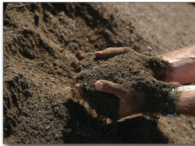
Figure 5. Mature compost product

Compost can be produced from many raw organic materials, such as leaves, food scraps, manure, and biosolids. However, the mature compost product bears little physical resemblance to the raw material from which it originated.