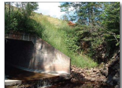
Figure 4. Same slope after revegetation