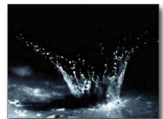
Figure 12. Impact of rainfall

Grass, wildflower, or native plant seeds appropriate for the soil and climate can be mixed into the compost. Although seed can be broadcast on the compost blanket after installation, it is typically incorporated into the compost before it is applied, to ensure even distribution of the seed throughout the compost and to reduce the risk of the seed being washed from the surface of the compost blanket by stormwater. Wood chips may also be added to reduce the erosive effect of rainfall's impact energy.